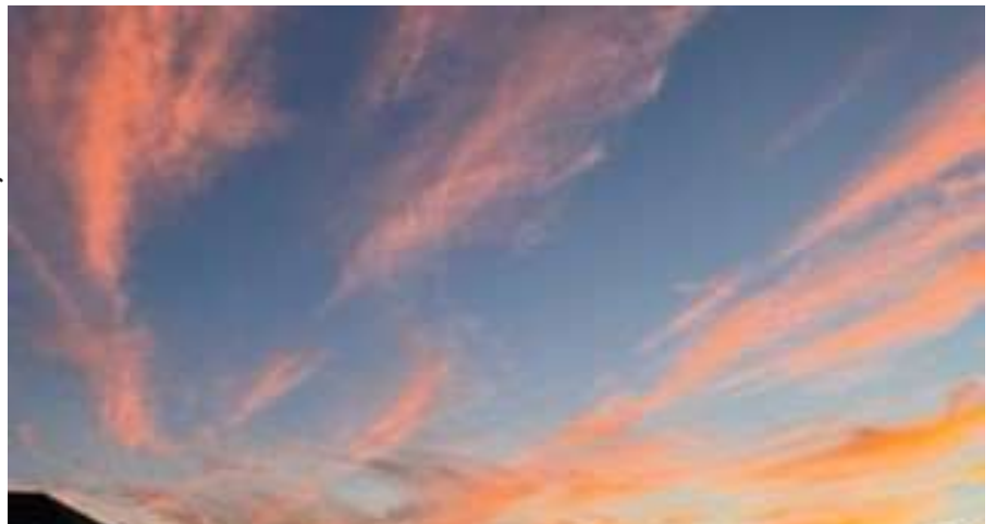
Beautiful Champion Sunset!

St. William Music Ministry invites you to share your musical talents and join one of our groups. Please see me after any weekend mass or call STW office 330-847-8677.